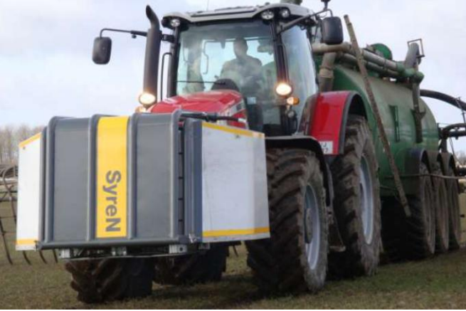
Figure 1. The SyreN-system includes three tanks installed on the front of the tractor. 1: Tank for iron sulphate. 2: Here the tank for sulphuric acid shall be placed. 3: Tank for water for cleaning the system.