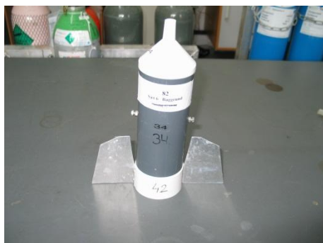
Figure 2. Picture of a passive flux sampler fitted with mounting pivots and fins to keep the device aligned with the wind.

Passive flux samplers were used as ammonia traps (See picture in Figure 2). By this system the ammonia holding air passively passes through the internal of the passive flux samplers. The internal of the passive flux samplers was coated before the sampler were attached to the measuring masts by an acid solution (Leuning et al. , 1985). The passive flux samplers consists of an outer cylinder fitted with mounting pivots and fins to keep the device aligned with the wind and a detachable venturi shield which holds a thin orifice plate (see Figure 2). When passive flux samplers are used for trapping of ammonia, the determination of a wind profile is not required.