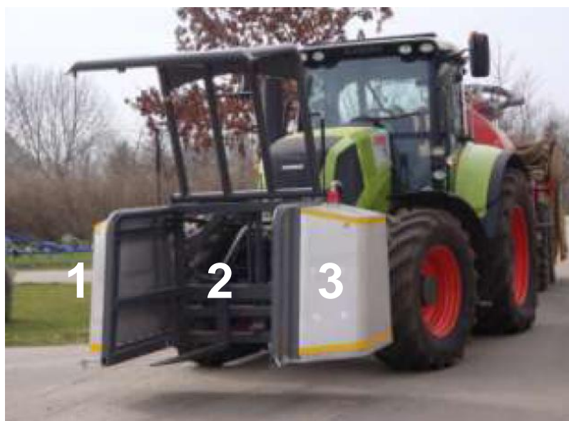
Figure 1. The SyreN-system includes three tanks installed on the front of the tractor. 1: Tank for iron sulphate. 2: Here the tank for sulphuric acid shall be placed. 3: Tank for water.

Table 2 contains technical data on the SyreN system.