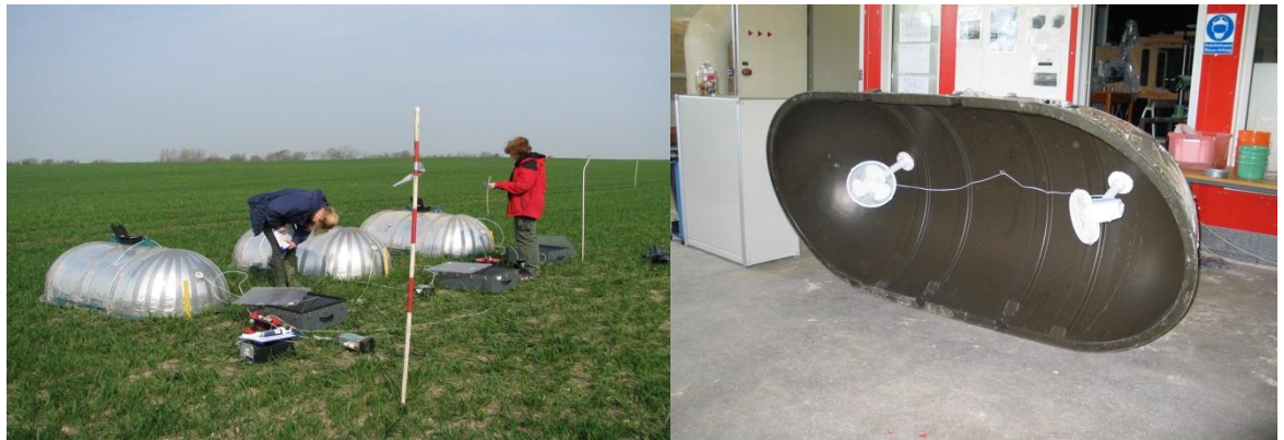
Figure 3. The static flux chambers. The left picture shows the three identical passive flux chambers used for sampling of air above the land applied slurry. The right picture shows the internal of the chambers and the internal ventilators.

The external surface of the chambers was covered by aluminium foil to restrict unequal solar heating of the chambers during sampling. The manure-treated surface was covered by the static flux chamber immediately after manure application.